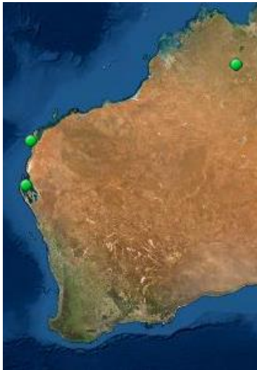
Figure 1: Map of World Heritage Properties in WA; https://whc.unesco.org/en/statesparties/au

Three natural World Heritage properties are located in WA: the Shark Bay World Heritage Area, the Ningaloo Coast World Heritage Area and the Purnululu National Park World Heritage Area.