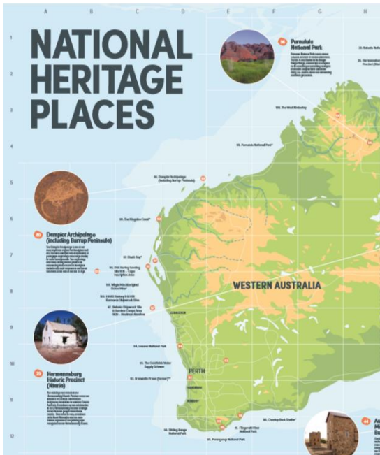
Figure 2: Map of National Heritage places in WA 40