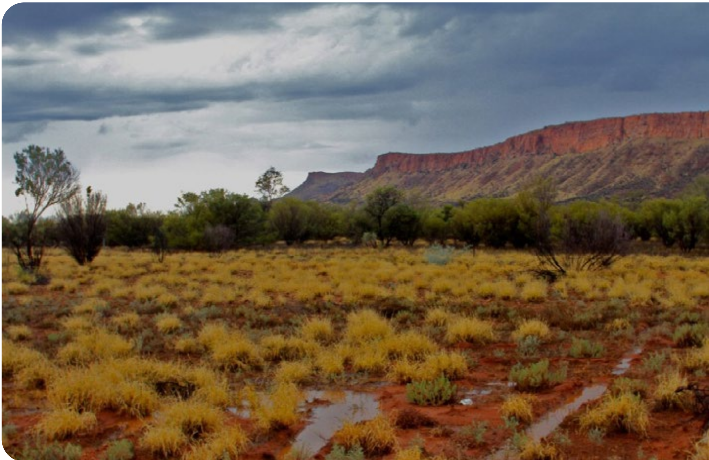
Northern Territory, landscape after rain, Environmental Defender's Office.

It is extraordinary that clearing of this scale was not referred to the Commonwealth and did not trigger the EPBC Act. This case study demonstrates the sheer scale of what can be approved by a territory government without adequate environmental impact assessment.