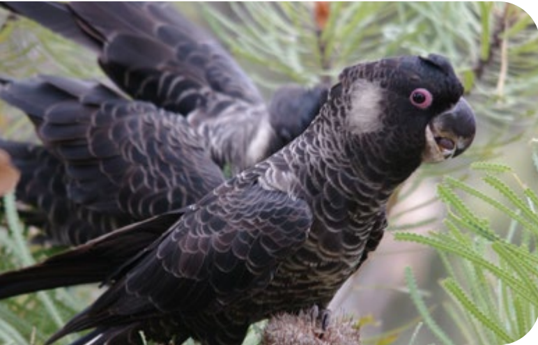
Carnaby's black cockatoo.

Carnaby's Black-Cockatoo is federally listed as Endangered, and the Perth-Peel subpopulation of Carnaby's Black-Cockatoos is estimated to have declined by 35% since 2010, due to the ongoing clearing of foraging and roosting habitat on the Swan Coastal Plain. With more than 70 per cent of banksia woodland now cleared, the species has become increasingly reliant upon pine plantations north of Perth to survive.