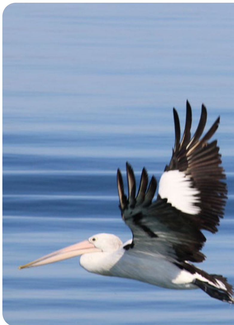
Pelican, Moreton Bay Marine Park.

Serious questions have been asked around the proponent's influence over the development assessment process, and the impacts on public scrutiny and accountability that have arisen from a confidentiality deed entered between the developer, the local government and the state government which has prevented open consideration and discussion of the controversial project. 41 Further, in 2016, while the project was actively being considered by the federal Coalition Government, the developer donated $200,000 to the federal Liberal Party. Developer donations are banned