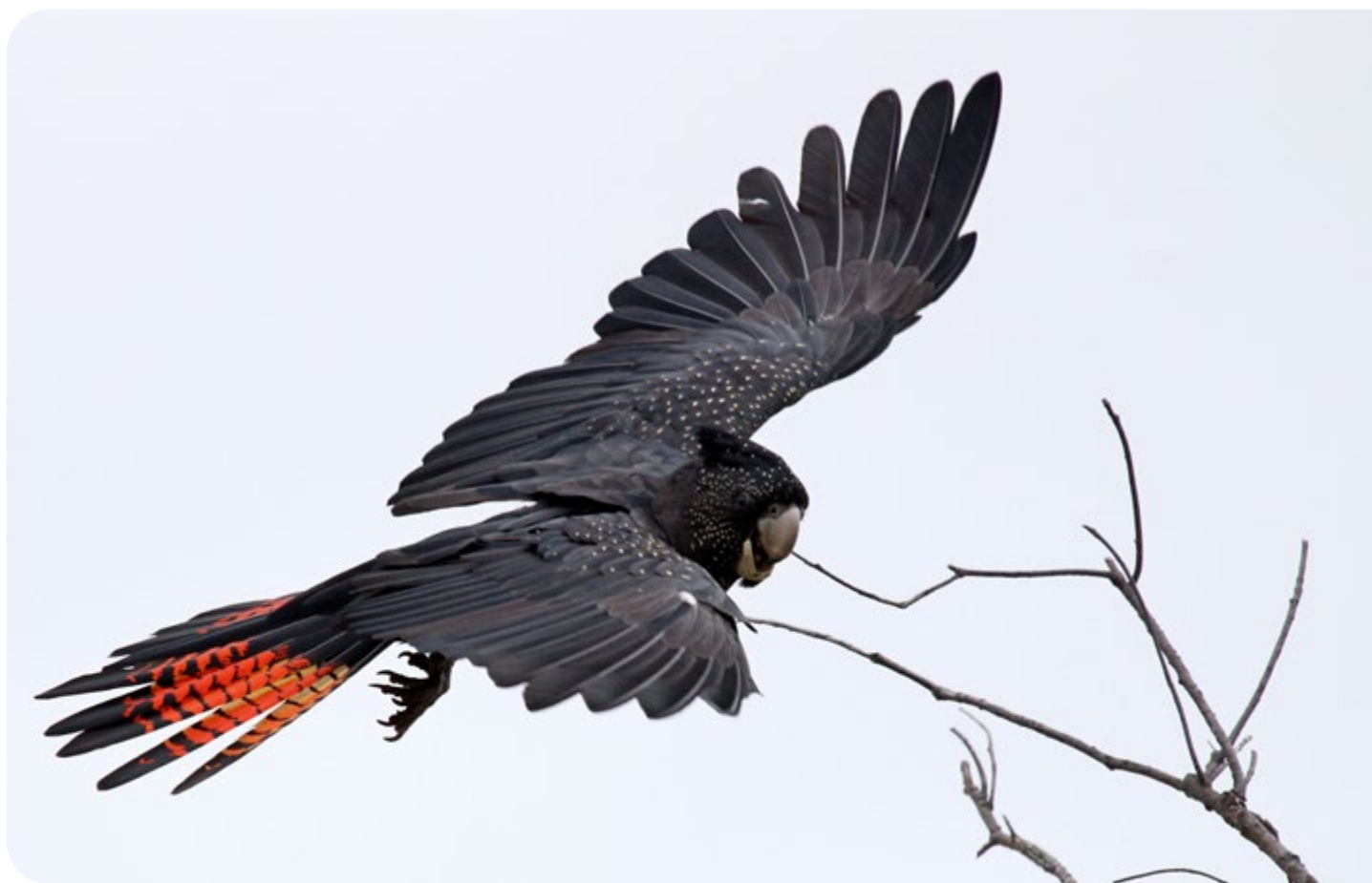
Red Tailed Black Cockatoo.

This case study demonstrates serious issues relating to state impacts on matters of national environmental significance, ineffective federal oversight, state level conflicts of interest, access to information barriers, and the use of strategic assessments as an excuse not to address individual action impacts.