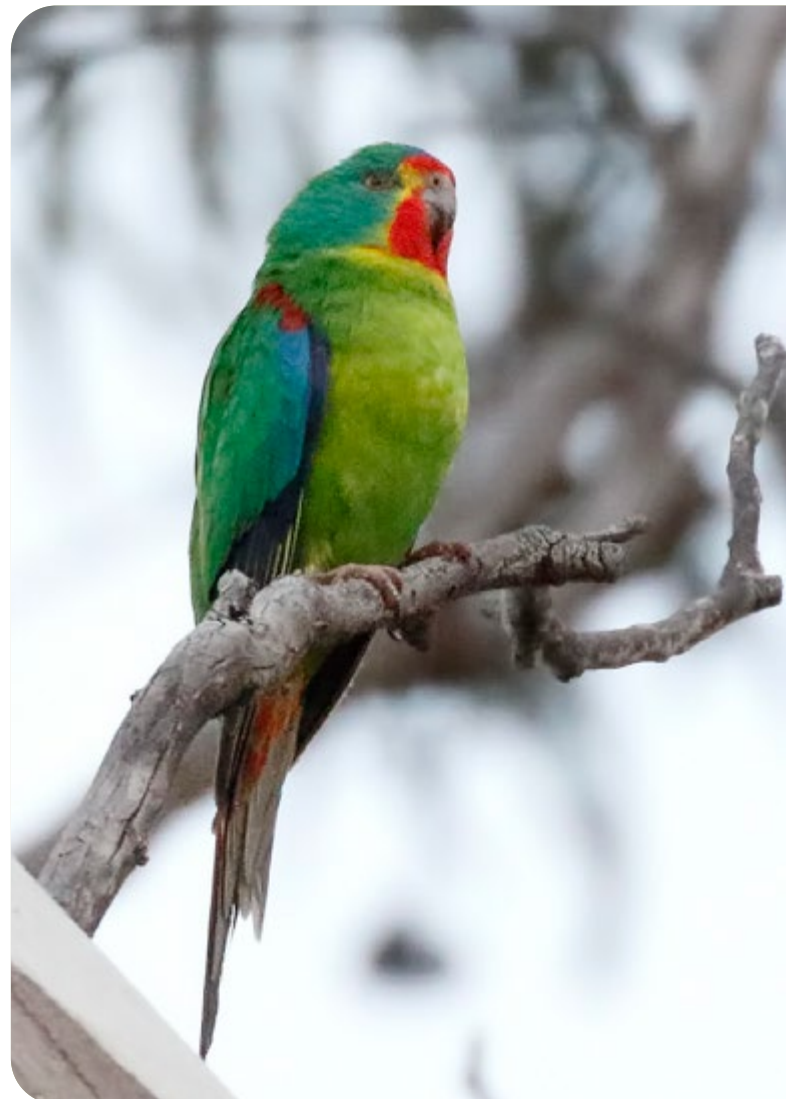
Swift Parrot.