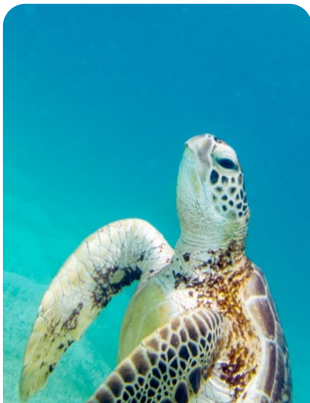
Green Sea Turtle, Queensland.

This is a clear example of the need for Commonwealth involvement and oversight in accredited schemes and ongoing compliance to ensure that Australia's international obligations in relation to environmental management are met and nationally listed species are protected.