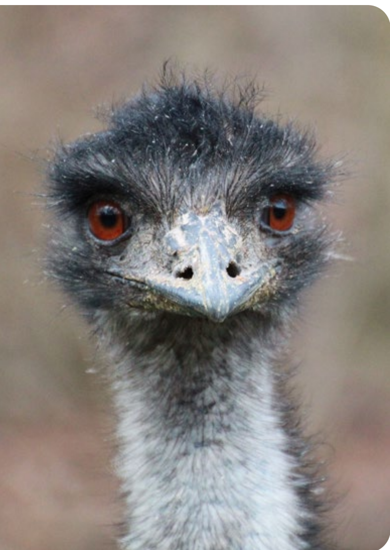
Table 1 , right, summarises the analysis of planning and environment legislation in each state and territory against core EPBC Act standards.

For state and territory laws to meet new national standards for environmental outcomes and assurance - as foreshadowed by the independent review process - there would need to be significant reform at the national, state and potentially regional and local levels. There would need to be both legislative reform, governance reform and significant resourcing at multiple levels to ensure that national standards were consistently applied and enforced on the ground at the project level. This analysis shows the scale of the reform task is substantial and should not be underestimated.