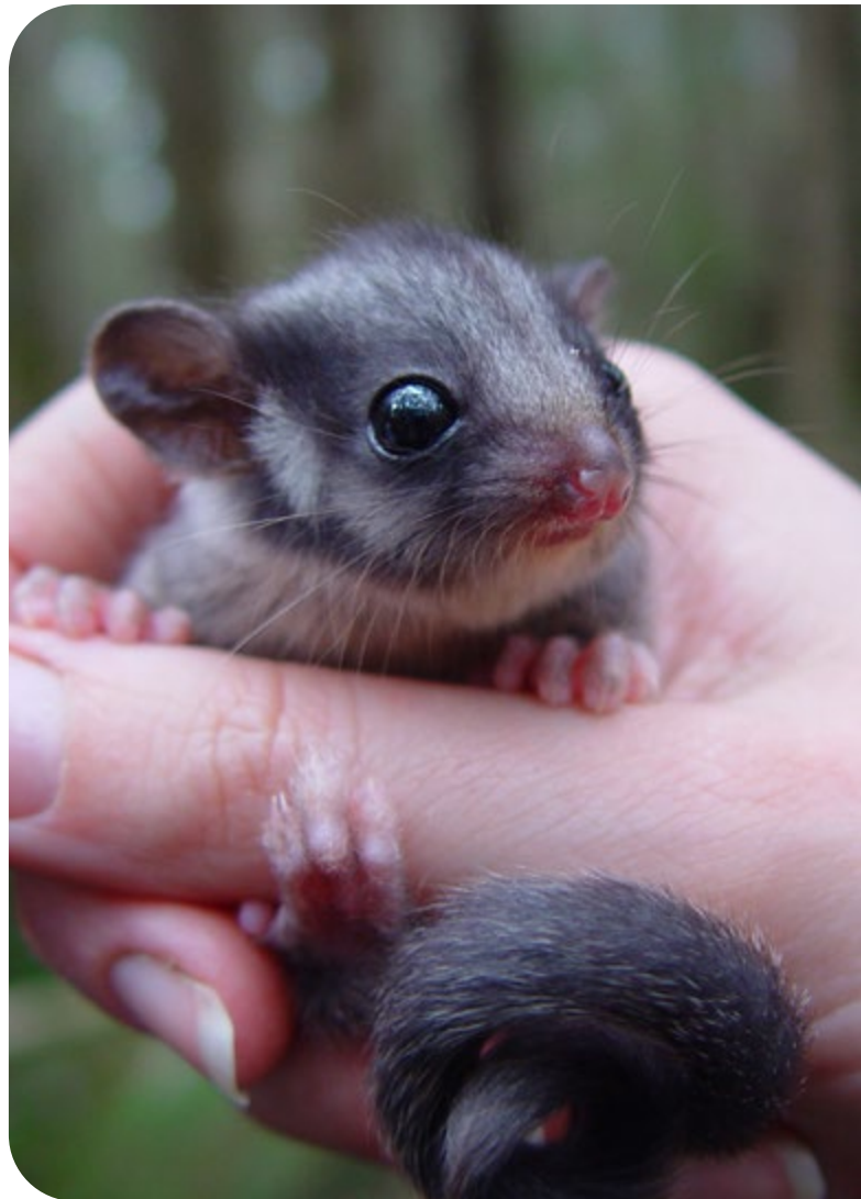
Leadbeater's Possum.

The Friends alleged that VicForests logging operations in Victoria's Central Highlands failed to comply with Victorian timber harvesting regulations, and that this failure meant that the exemption from the usual EPBC Act protections did not apply. They further claimed that VicForests logging operations did not comply with the EPBC Act and that past and planned logging has had and will continue have a significant impact on the Leadbeater's Possum and Greater Glider.