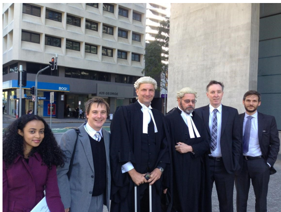
Legal team and client in Alpha Court of Appeal case

Update: On 27 September, the Court of Appeal dismissed the appeal, clarifying that emissions from the burning of coal are relevant in the assessment of coal mines in Queensland – an issue that had been hotly debated until now. It is now clear that each coal mine may be required to argue on the facts whether the mine will in fact increase global emissions. On 25 October, our client filed an Application for Special Leave to Appeal to the High Court.