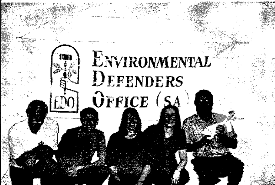
Volunteers and staff