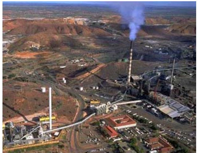
Mount Isa Mines

ties are renewed (which must happen within 3 years) the mines have to comply with current environmental standards. EDO welcomes these amendments.