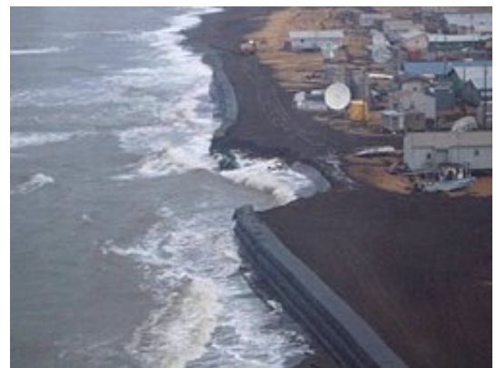
Erosion threatening the Village of Kivalina, in Alaska.

In late February 2008, the Alaskan Inupiat tribe of the coastal village of Kivalina filed a law suit against 24 American oil, coal and power companies for climate change impacts which are causing the village to slide into the Chukchi Sea. The village is threatened by melting permafrosts and glaciers and increased storm surges and has already relocated south once. Further relocation is now required which is estimated to cost more than $100 million dollars. The village is claiming damages for global warming against nine oil companies (including BP, Shell and ExxonMobil), one coal company and 14 power companies in the US District Court in San Francisco. EDO will watch the outcome of this case closely.