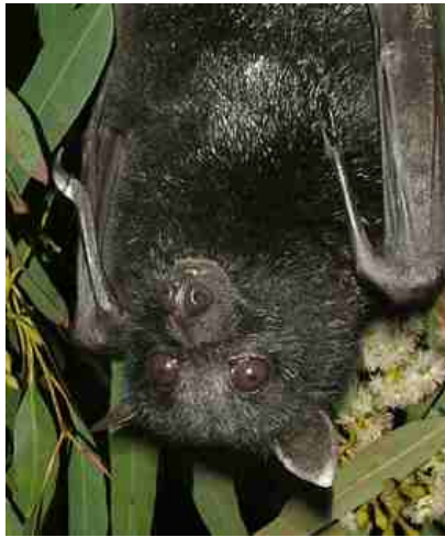
Black Flying Fox

For more information about EDO-Qld cases contact us on (07) 3211 4466 or edoqld@edo.org.au .