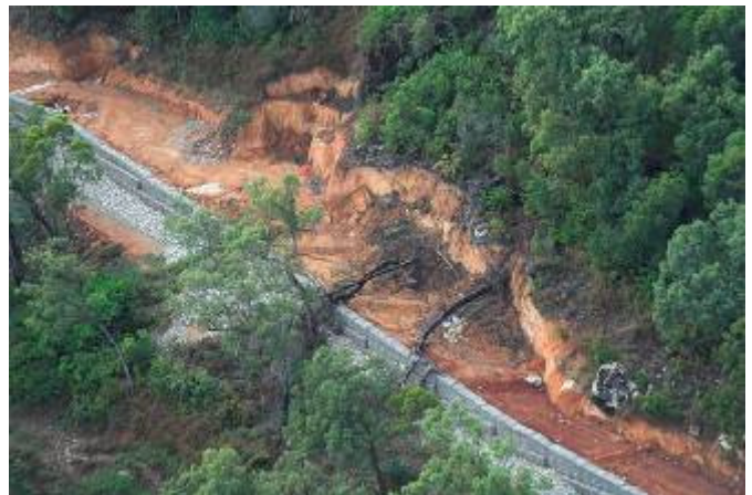
False cape photo: www.stevennowakowski.com .

However, there are further legal avenues open to Cairns Regional Council and the state government to hold the developer accountable for these approval breaches. EDO-NQ understands there have also been other approval breaches, relating to the destruction of rare and endangered plants on site. EDO-NQ is very disappointed that no action has been taken by EPA or