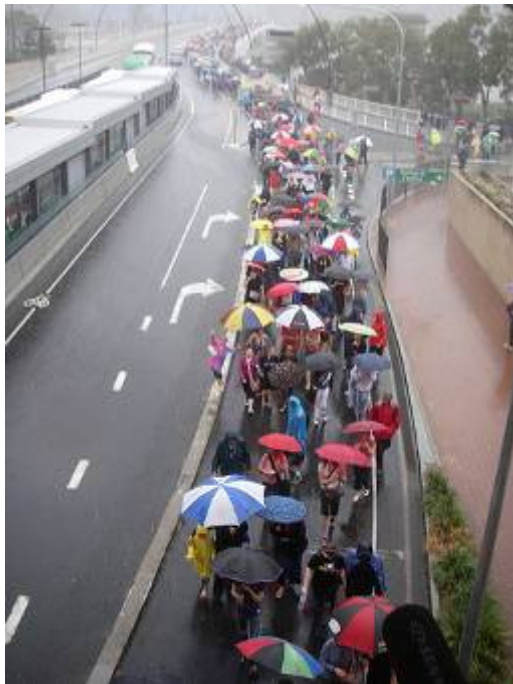
Brisbane's 2007 Walk Against Warming

In Brisbane, the Walk will begin at Queens Park in the CBD at 12:30pm. For more information see www.walkagainstawarming.org .